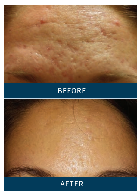
FEMALE | 6 PROCEDURES